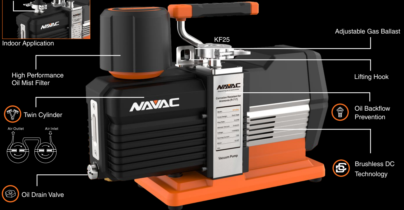
High Performance Oil Mist Filter