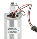
replacement sensor element

Order #: GG-VL2-NH3 GG-VL2-NH3-RS (replacement sensor)